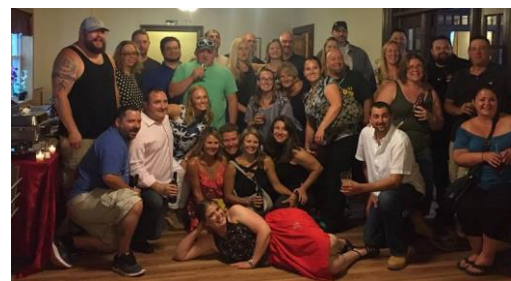
Members of the Class of '97, pictured, celebrated their 20 th reunion in style this past summer.

Did you recently graduate from college? Get married? Move? Get a promotion, own your own business, or retire? Become a parent or grandparent? Share your news with fellow alumni by emailing: unategoalumniassociation@gmail.com .